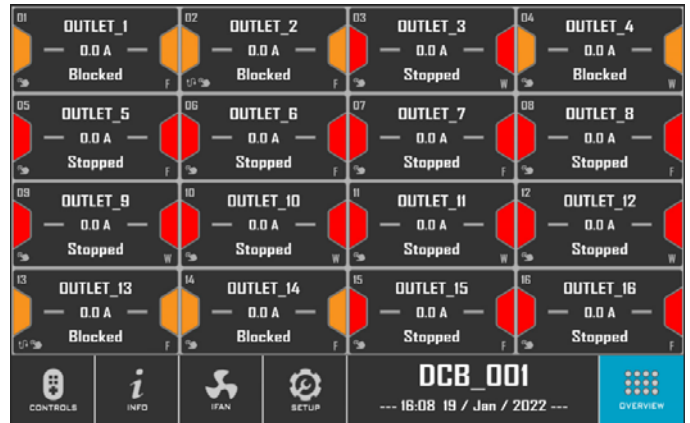
Protection Interface Platform GUI (max of 16 outlets shown)