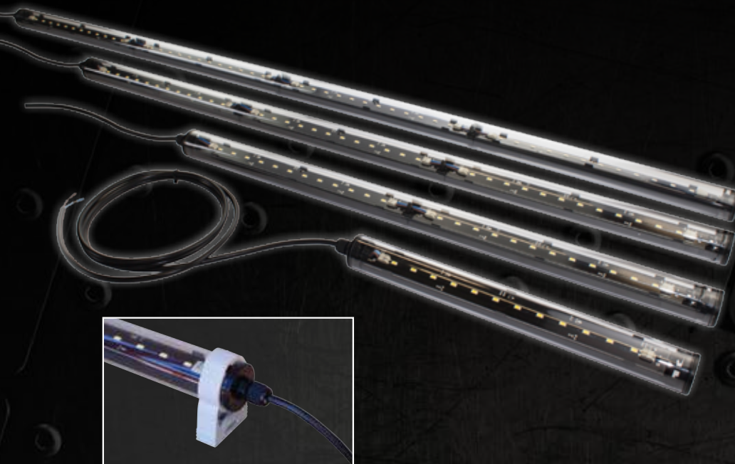
Mounting clips supplied